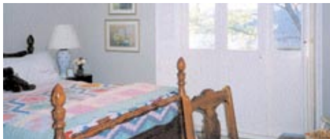
▲ Before: Undersized shutters on the large window looked skimpy and a furniture arrangement with the desk at the foot of the bed made circulation awkward.