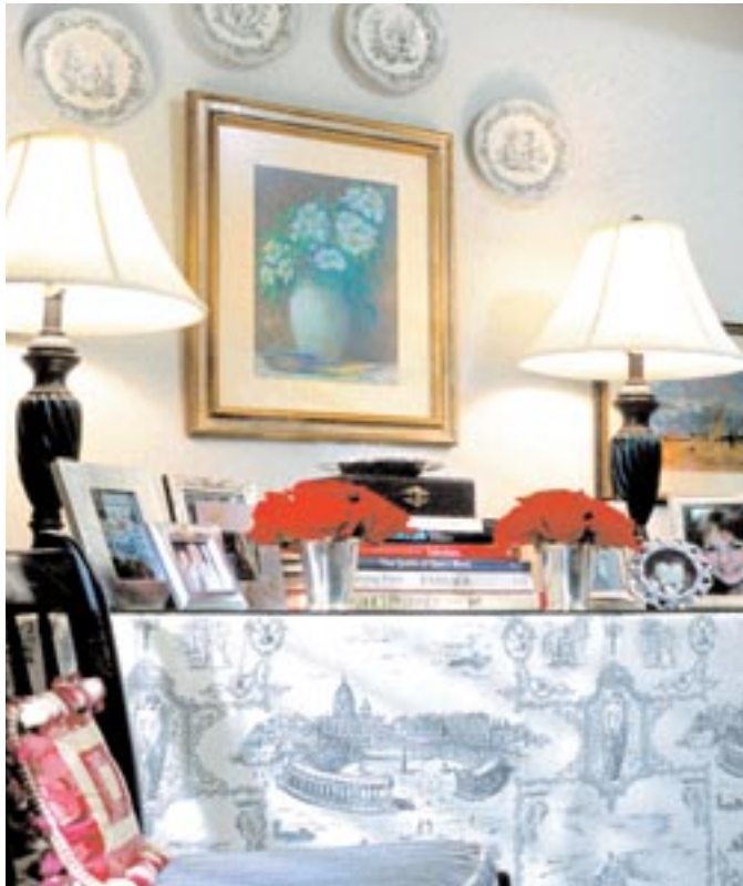
▲ After: Plates hung around a favorite family painting give the art piece, which looked too small otherwise, a stronger presence in the room. A slipcover was made to give the old console more weight in the room and provide needed storage.

guests to have a larger table by the bedside—now there is plenty of room for a book, a glass of water and reading glasses,” she adds.