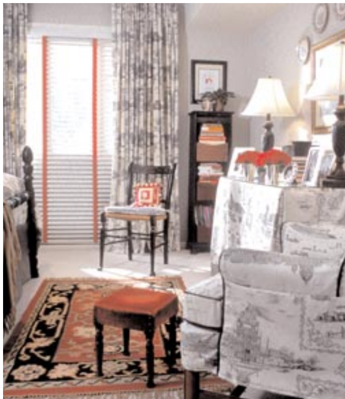
After: The window treatment of Hunter Douglas blinds and Kravet toile curtains was the starting point for the room makeover. A matching custom slipcover updates an existing wing chair, and a red area rug from Pottery Barn pulls in red accents throughout the room.