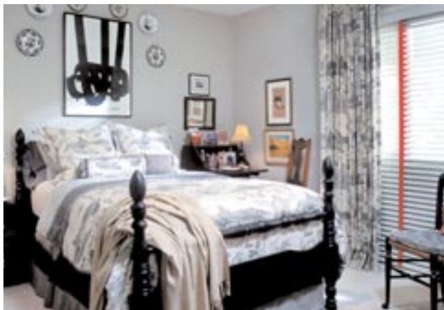
▼ After: A subdued color palette of black and white, with splashes of red, help contemporary and traditional items blend together. The furnishings were rearranged for better flow and function, and the original bed was painted black to bring its look up to date.