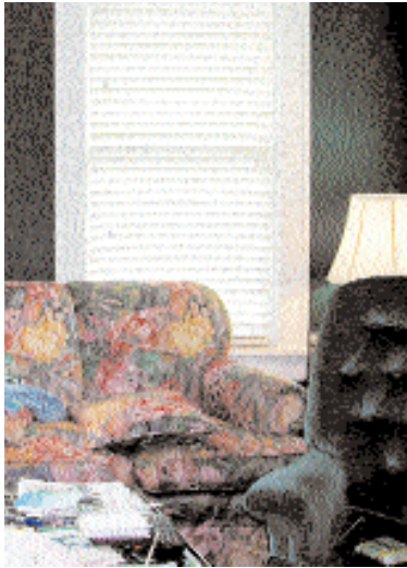
Before: "I wanted to change from dark green walls and 'flowers galore' to something less babyish," says Lily, 11. A larger den was converted to Lily's new bedroom.