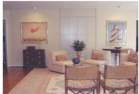
BEFORE: The TV was placed uncomfortably in the top of the cabinet, and the most unwelcoming seating in the room faced it. Shiny brass art frames were distracting.