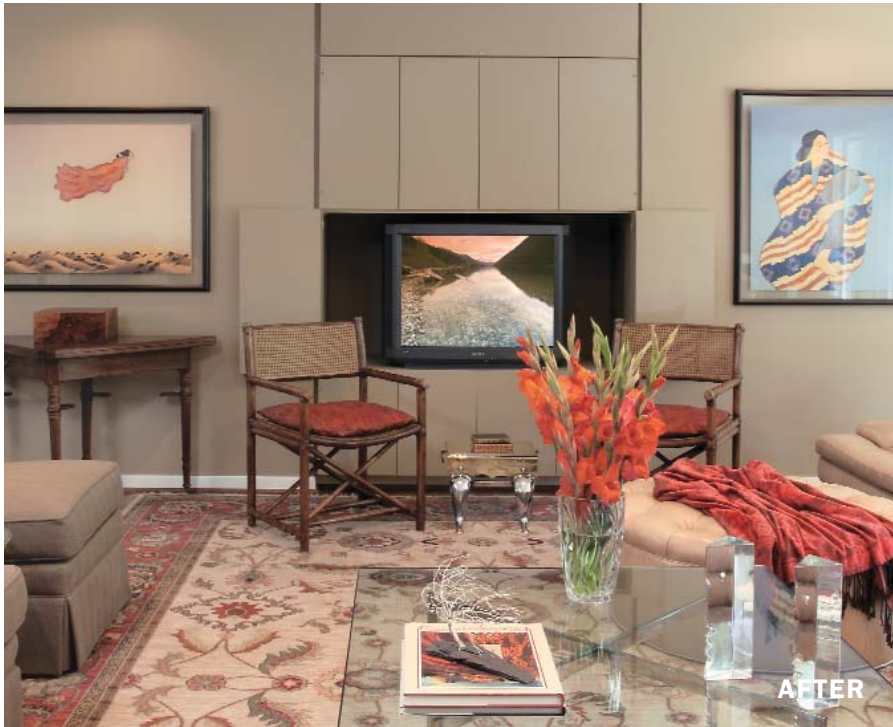
AFTER: Deeper wall color, painted art frames, a new rug, sofa, throw pillows and rearranged furniture and accessories (plus lowering the TV) updated the room, making it more usable.